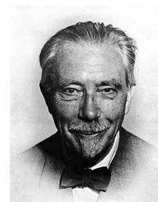
August Krogh (1874 - 1949) Nobel prize in Physiology and Medicine 1920

This annual award is intended for a graduate student, Ph.D. or M.D. in the early stages of a research career. The purpose of the award is to encourage excellence in microcirculatory research by new, young investigators. Eligibility for this award is limited to graduate students, recent graduates (less than 3 years after having received a Ph.D. or for M.Ds, 3 years following completion of a first residency). The award consists of a certificate and $500 to be used at the discretion of the awardee. The requirements include submission of a brief manuscript which describes research to be presented at the annual MCS meeting and a letter of nomination from a member of the Society. These materials should be forwarded to the Chairman of the Awards Committee prior to November 1st of the year preceding the award.